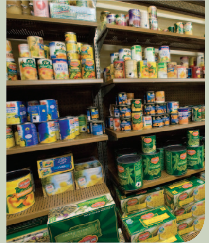
The week before Christmas, A Time is Now Food Pantry in Walworth County served 101 families. (Jim Dresher, center)

On the Wednesday before Christmas there wasn't an open parking spot at the WC Recourse Center where A Time Is Now Food Pantry resides in Lake Geneva. The upper level of the resource center resembles a doctor's office waiting room.