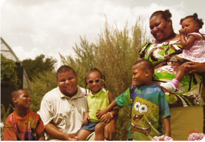
SNAP outreach helps families get the extra support they need.

A Cudahy family of five has been relying on Project Concern for help putting food on the table for some time. The dad had been working three jobs to support his family, including three children who have special needs. When the mom was diagnosed with cancer, they realized they needed more help.