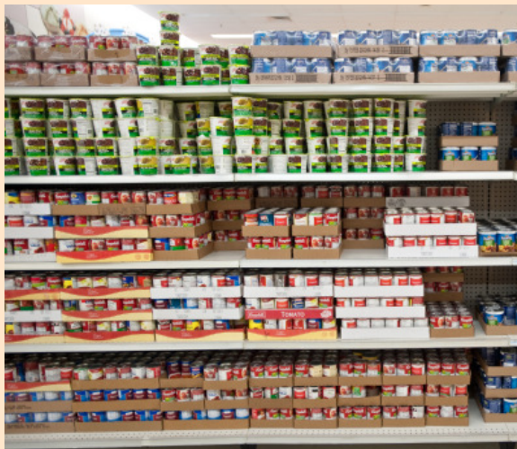
Feeding America Eastern Wisconsin's Fresh Rescue Program provides non-perishable items and produce for the Oshkosh Area Community Pantry.